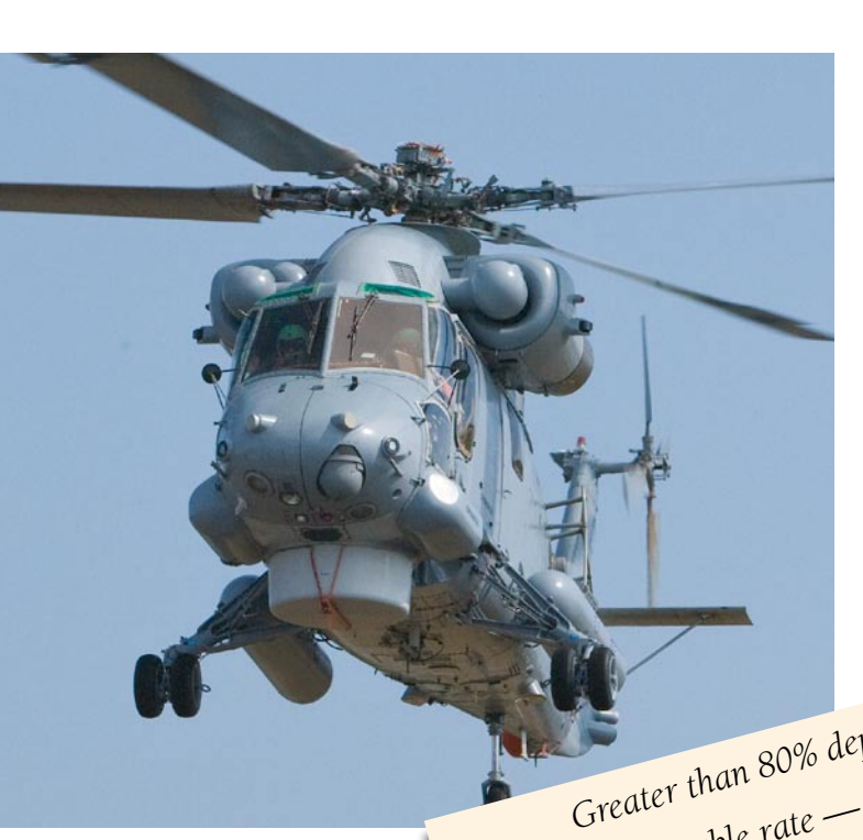
Greater than 80% deployed Greater than 80% deployed full-mission capable rate — documented by Kaman-supported customers.

The SH-2G: backed by Kaman – a leader in multi-mission maritime helicopter technology.