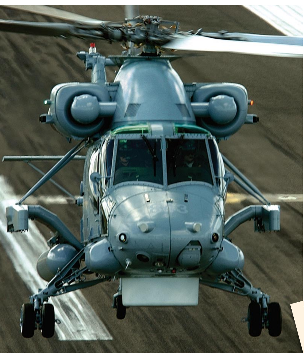
The SH-2G is the most experienced multi-mission maritime helicopter.

The Kaman SH-2G Super Seasprite is the ideal multimission maritime helicopter. From anti-submarine warfare, to anti-surface warfare, over-the-horizon targeting, utility and search and rescue — you name the missions, the SH-2G meets the challenge!