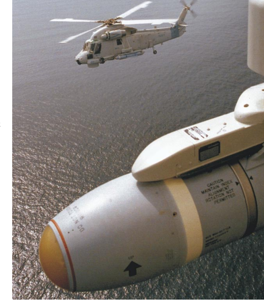
This Royal New Zealand SH-2G can carry an array of weaponry, including Maverick missiles, shown above.