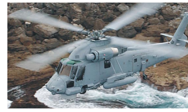
The SH-2G Super Seasprite features a comprehensive aircraft self-protection suite, above, and is at home at sea.

The fully articulated main rotor system, titanium hub and exclusive, highly reliable servo-flap control system ensures pilot-friendly, low vibration flight operations. Pilots, crew and aircraft systems enjoy low vibration levels, ensuring longer life for components and reduced fatigue for crew members, enabling maximum focus on the mission. The Super Seasprite's extremely low vibration levels are the standard others can only hope to achieve. The aircraft maintains the best vibration levels thanks to its unique in-flight blade tracking system.