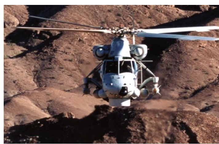
The SH-2G has the highest power-to-weight ratio of any helicopter in its class, delivering the best "high-hot" performance in the industry.