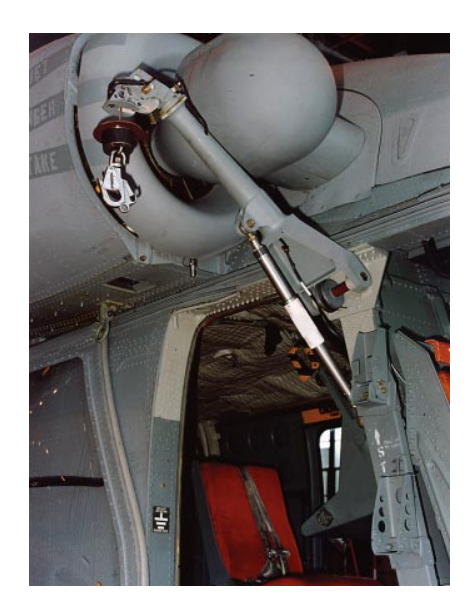
Full-time, 600 lb capacity, rescue hoist.

Because of the ease with which pilots fly the SH-2G, it is an ideal helicopter for visit, board, and search and seizure operations.