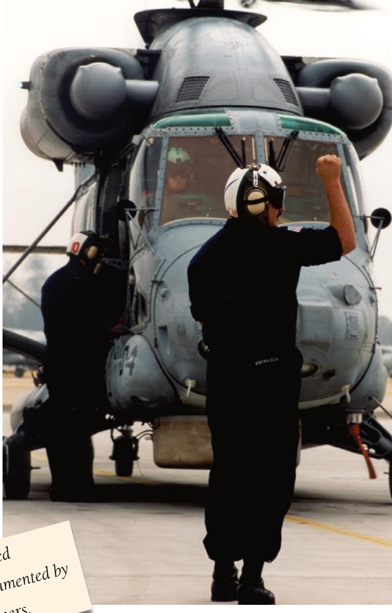
Kaman provides full logistical support and can be tailored to specific fleet requirements.